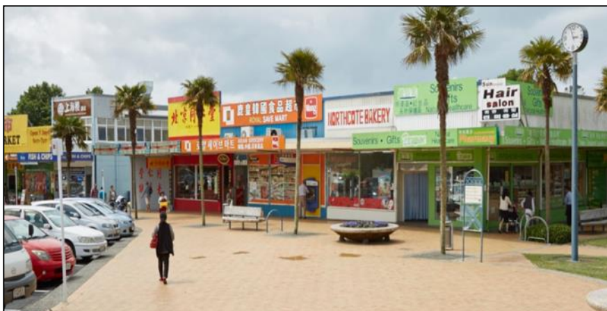
Figure 1 Northcote town centre

Urban change, including population growth and the emergence of new kinds and expressions of diversity, raises important questions for policy makers, community service agencies, and local residents alike. These project briefs are designed to provide research findings related to the meanings and practices of community within neighbourhoods (CaDDANZ Brief 8), how people see difference and how diversity impacts residents’ sense of home and community (CaDDANZ Brief 9), the significance of the local neighbourhood for the wellbeing of older adults (CaDDANZ Brief 10), and residents’ perceptions and experiences of the Northcote Development (CaDDANZ Brief 11).