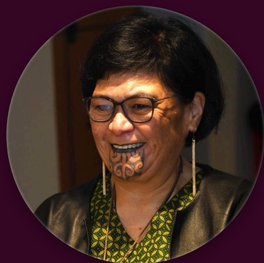
Hon. Nanaia Mahuta