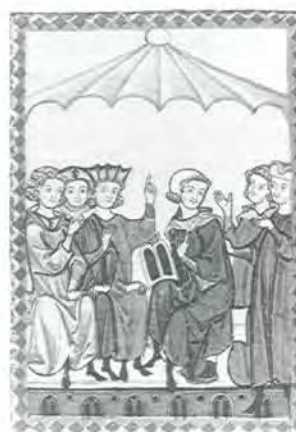
The academic gowns and hoods worn by graduates and University staff today are fashioned on everyday medieval garments.

In the Middle Ages the corporate existence of universities was recognised and sanctioned by civil or ecclesiastical authority. The regalia worn by graduates and university staff today reflect this mix of medieval governance. Robes worn by the Chancellor resemble those worn by the Lord Chancellor of England. Graduates and academic staff wear gowns similar to the dress of medieval clergy. Hoods are also fashioned on an everyday medieval garment, although the coloured lining was a later addition to indicate the wearer's university and degree.